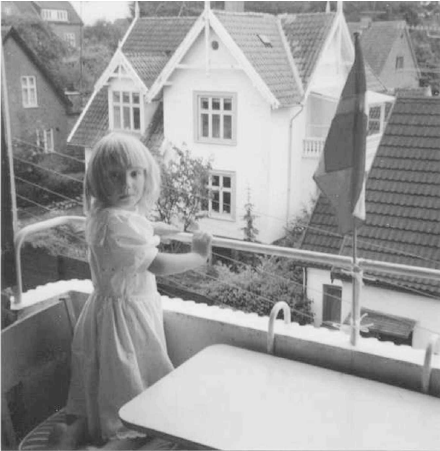
Figure 1 Birthday celebrations ...

observers may wonder at the frequent use of the national flag both in daily contexts, and as a symbolic marker during festivities (see Figures 1 and 2), and also the prevalence of the colours red and white in many everyday contexts, including newspaper lettering, road signs, Christmas decorations, art, and even clothing and kitchen linen. Red and white are very much part of everyday life, to the extent that this colour combination seems natural and is not noticed. In this way, the nation is flagged on a continual basis, and such 'routine nationalism' (Billig 1995: 35) ensures that the